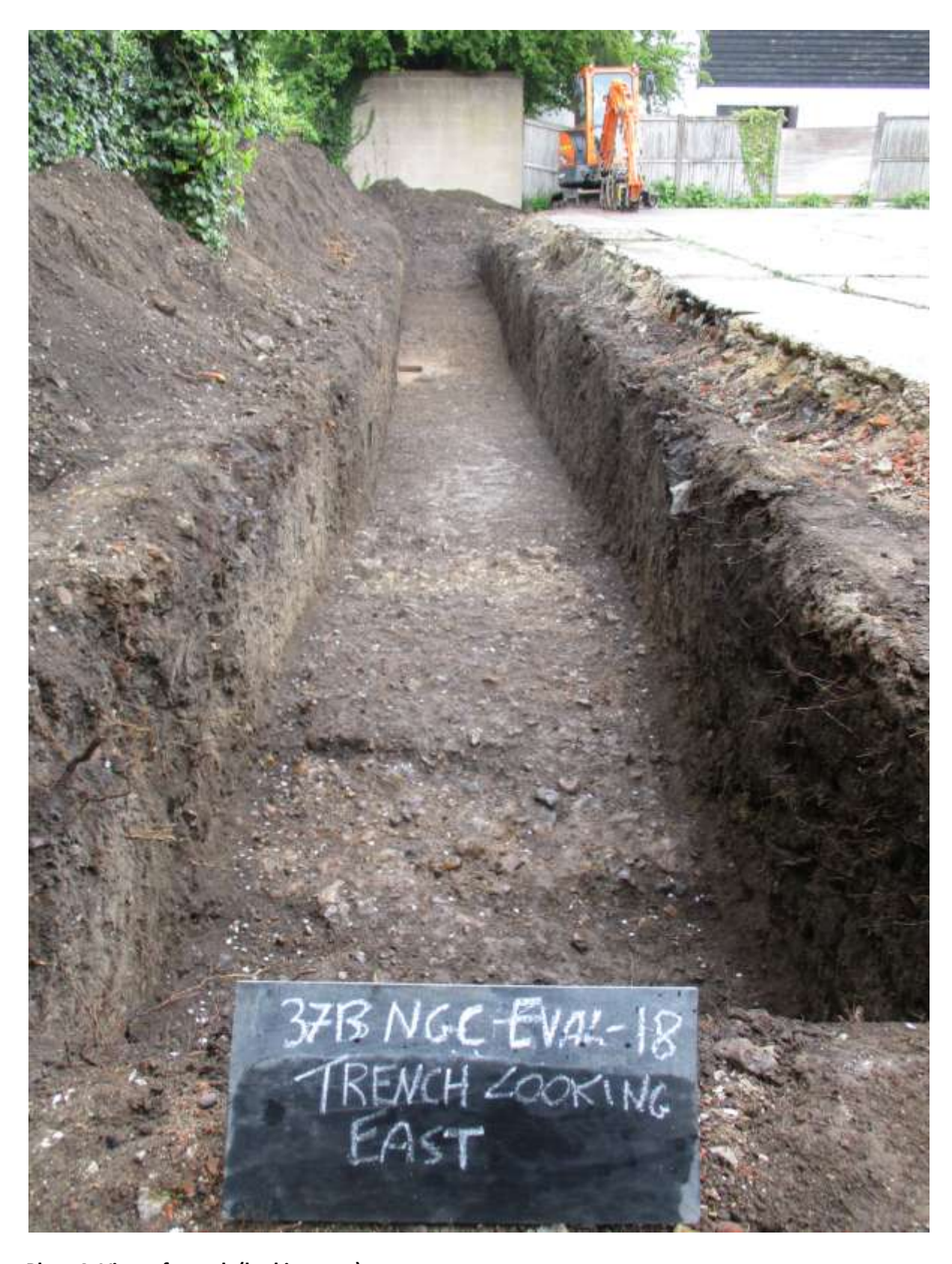
Plate 4. View of trench (looking east)