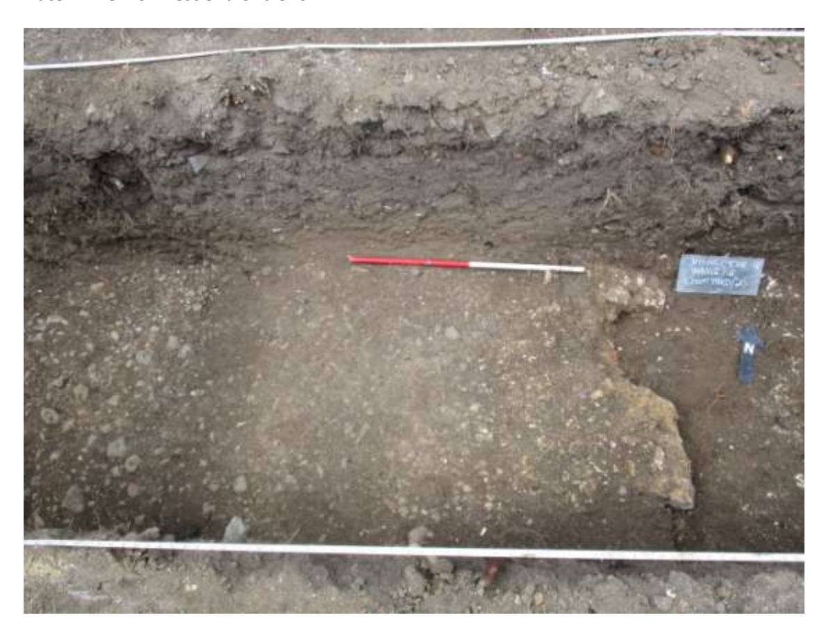
Plate 3. Overhead view of west end of trench