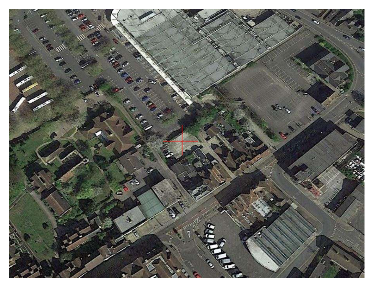
Plate 1. Aerial photograph of site (9/4/2017) Google Earth