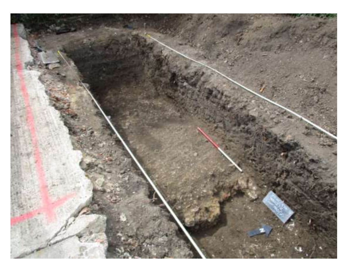
Plate 2. View of west end of trench