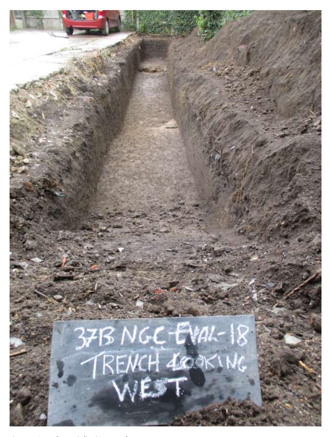
Plate 5. View of Trench (looking west)